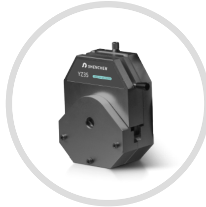
YZ35 (Aluminum Alloy)